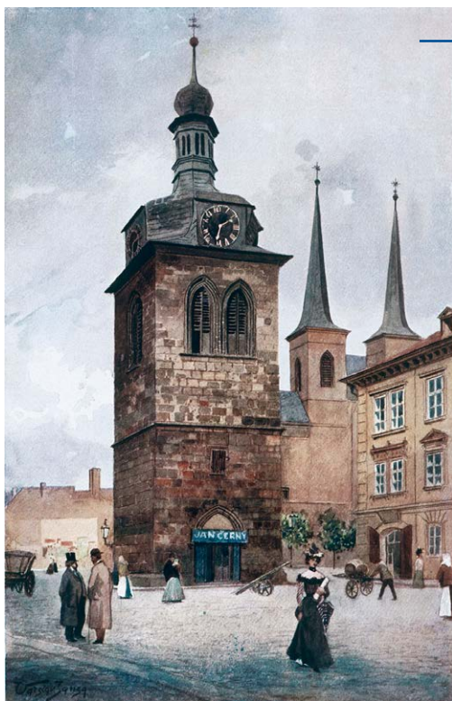
Painting by Václav Jansa, ca. 1890

The well-known Prague painter Václav Jansa painted St. Peter's bell tower in the year 1890 with the hanging signboard of Jan Černý. The bakery of the great-great grandfather of the author of the book was located in a corner building. A shop, where the old Prague baking family sold bread and their famous rolls, was in the tower gate.